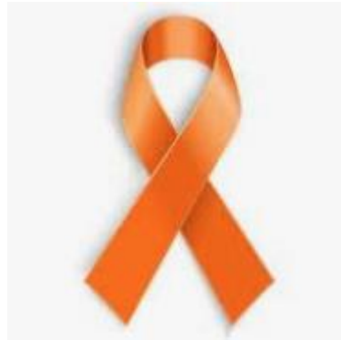
16 Days of Activism Orange the World Ribbons