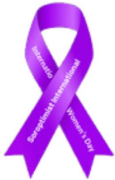
IWD Purple Ribbons

2024. Don't miss out on this fantastic opportunity to show off your SISEAP spirit!