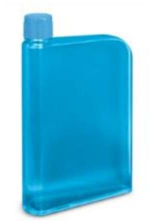
SISEAP Water Bottle