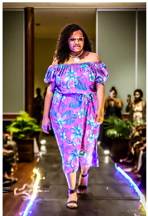
Top Left Presenting of cheque to Well's Women's Clinic. Top right induction of the 3 new members. Bottom Left and Right, models