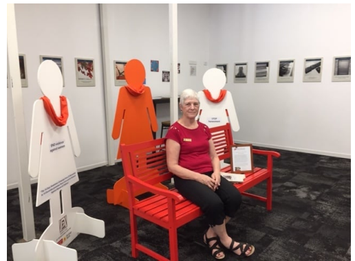
The club contributed to the campaign by having on display the Photo Voice Images as well as their support of the Red Bench Project.