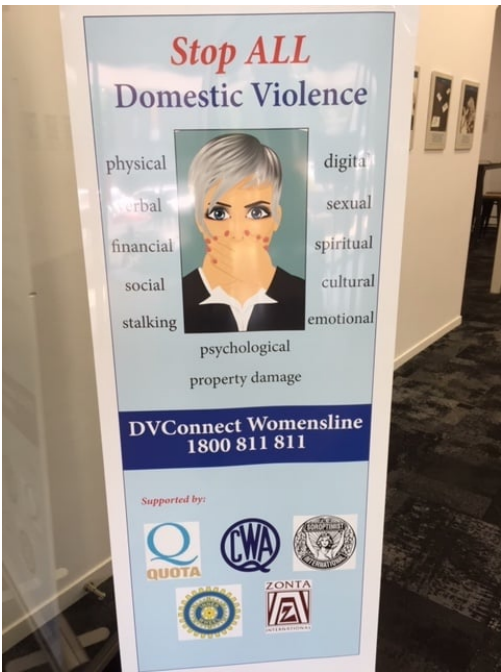
SI Toowoomba partnered with several other organisations for their 16 Days of Activism campaign, Strength in numbers, leading to a powerful campaign.