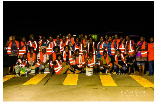
Soroptimist International Lae lead a team of like minded women in the city to paint a crossing the main market in Lae. The event was successful with support from business communities and government agencies and male champions and families who came out to support.