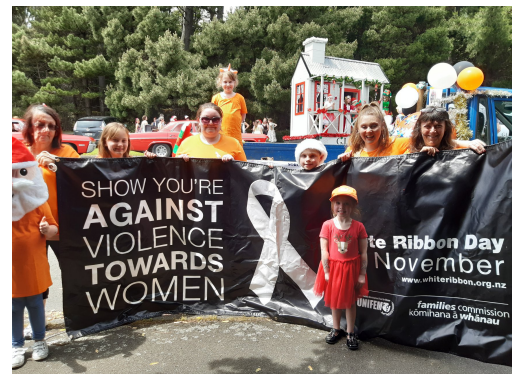
SI Invercargill not only joined with White Ribbon to raise awareness they did this at an Annual Christmas festival, Domestic Violence can occur at any time,