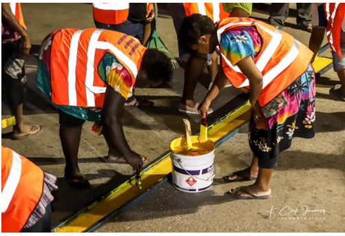
SI Lae - Safe City Campaign - 16 Days of Activism against Gender Violence . As part of Safe City and campaign to provide safe space for women and girls and End all Forms of Violence against women and girls,