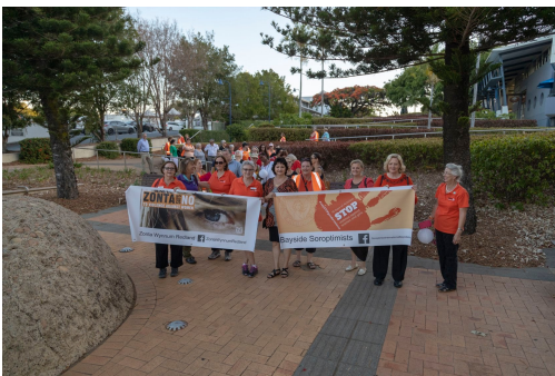
SI Bayside joined with Zonta, for their Walk the Talk

I urge you to follow this link to the SI Ramu facebook page, and read all the posts for the 16 days. https://www.facebook.com/Soroptimist-International-of-Ramu-Club-1517087088590642/