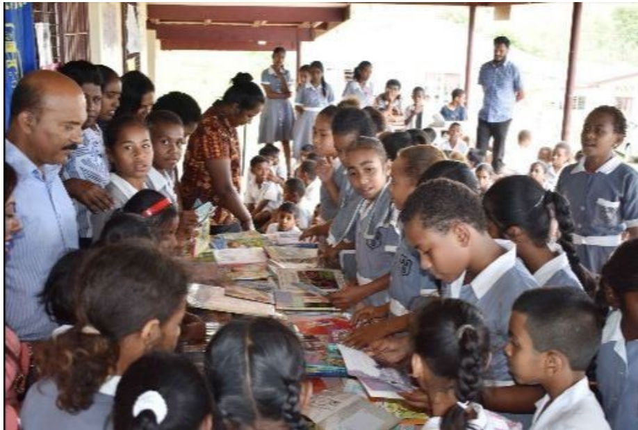
The excited children receiving the story books donated by the joint SI Lautoka and ACT & Monaro project.