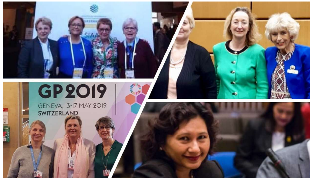
Some of our incredibly hard working representatives.