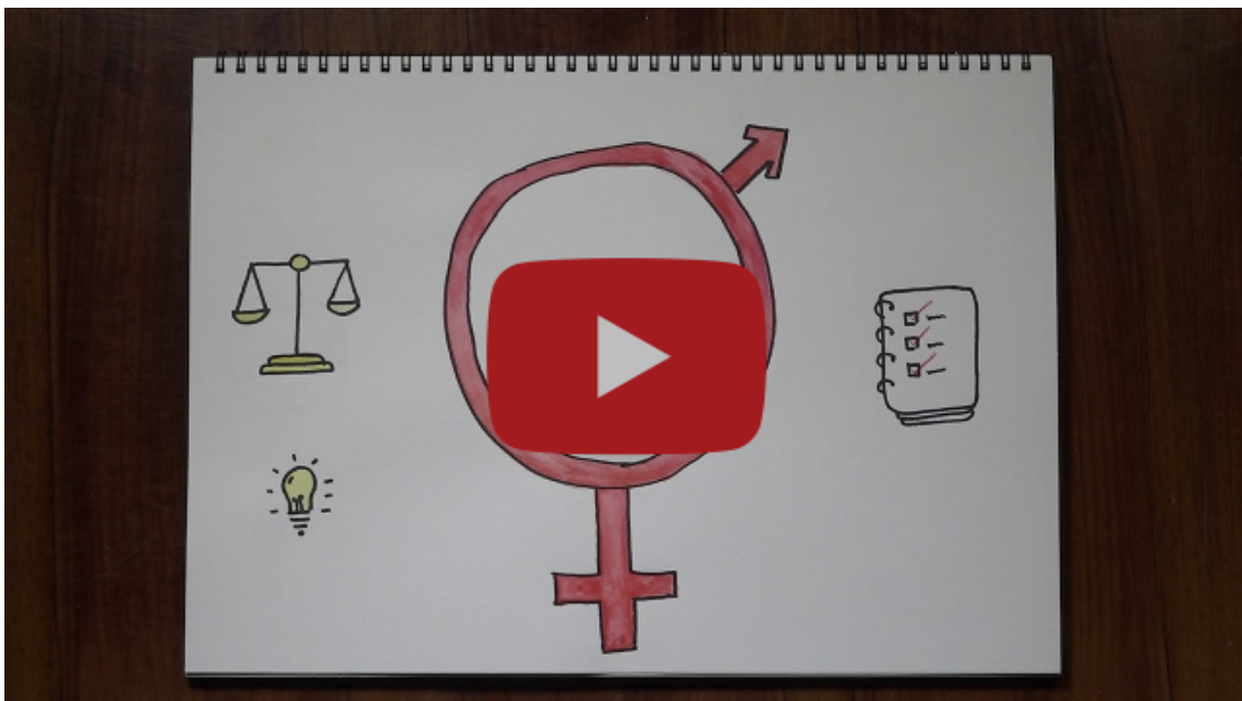
Gender and Climate Change – Gender Responsive Climate Finance from Heinrich-Böll-Stiftung Washington, DC